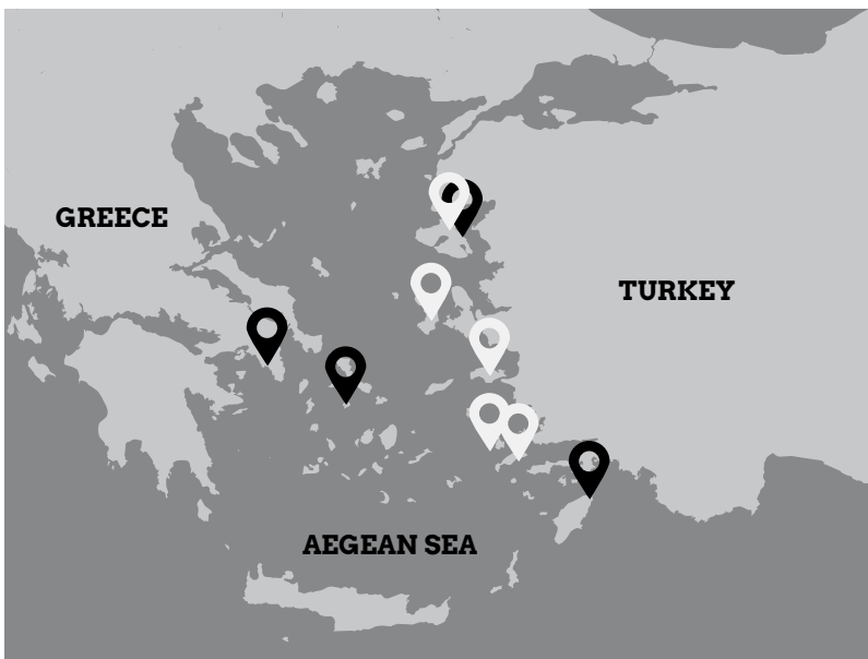
Location of Greek hotspots (in white) and competent courts (in black)

In conclusion, the geographical disparity between the hotspots and the courts, the detention or restriction of the potential appellants in the hotspots as well as obstacles in finding a lawyer in combination with the high costs of the procedures, render access to justice impossible in practice for the vast majority of the rejected asylum seekers in the hotspots . When designing the Greek hotspots , located on small islands where no courts are operating, practical aspects to safeguard even the physical access to justice were apparently not taken into consideration.